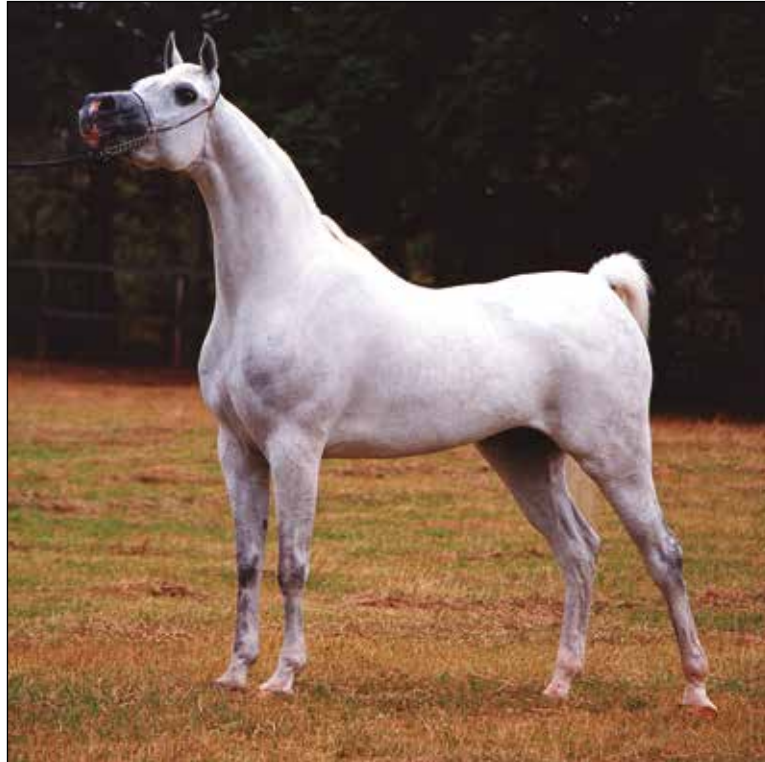
Godiwa JM (Kaaly JP (The Minstril) x SL White Lace (Strike x Aladdinn) - Born in 1996