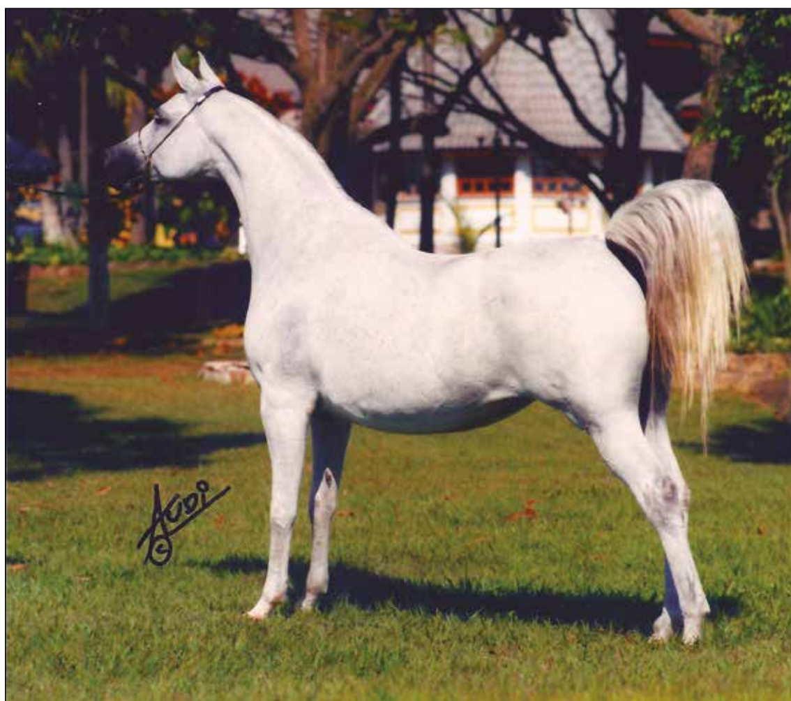
*SL White Lace (Strike x Four Winds Flare by Four Winds Flag) - Born in 1988

These markers define the selected mares for the Haras JM breeding program. The ability of each dam to