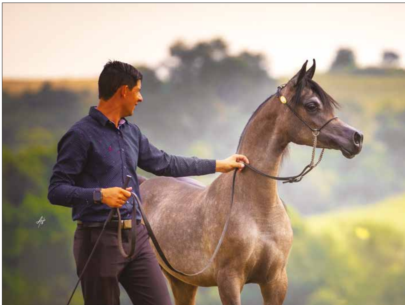
Justine Sharif JM (Sharif Al Zobair x MLP Paramour)

The genetic power of Haras JM's herd has already secured the farm's place among Brazil's most respected breeding programs. And with unwavering focus and dedication, Haras JM continues to earn recognition on the international stage—where its horses speak for themselves.