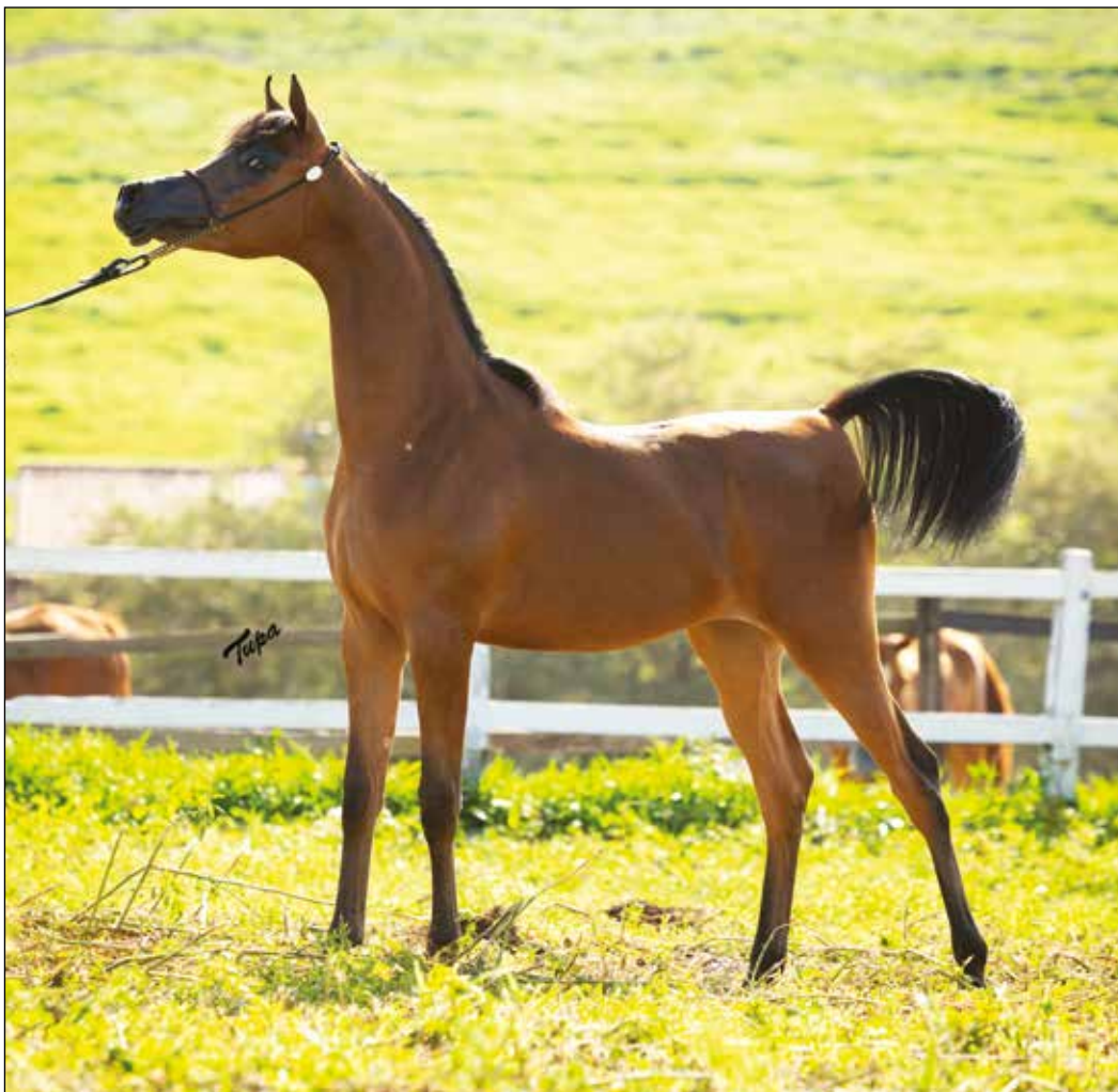
Jucienne D'Bandit JM (*Bandit SRA x Juenne Apprentice)