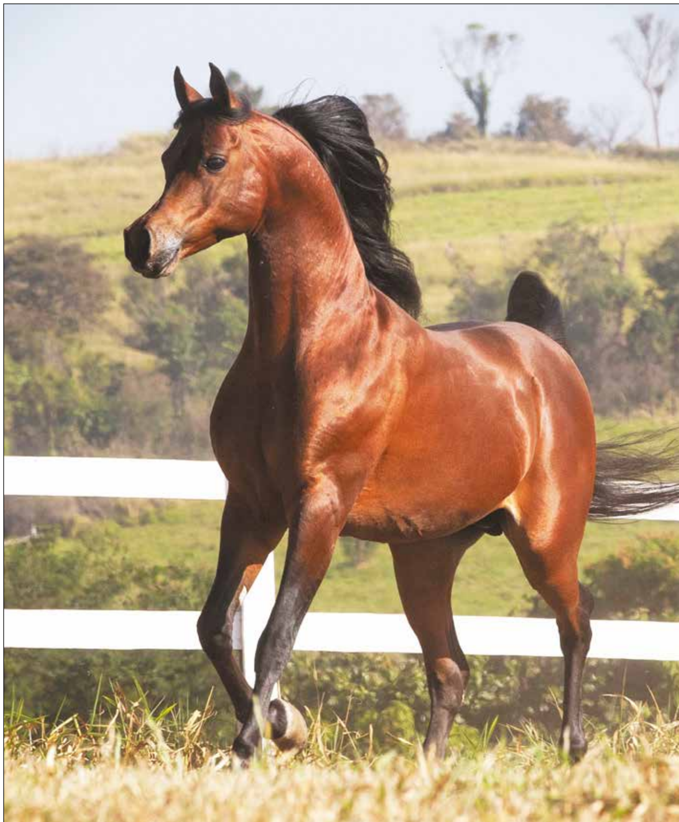
Yparadise JM (RFI Maktub x Maynah by Nuzyr HCF)