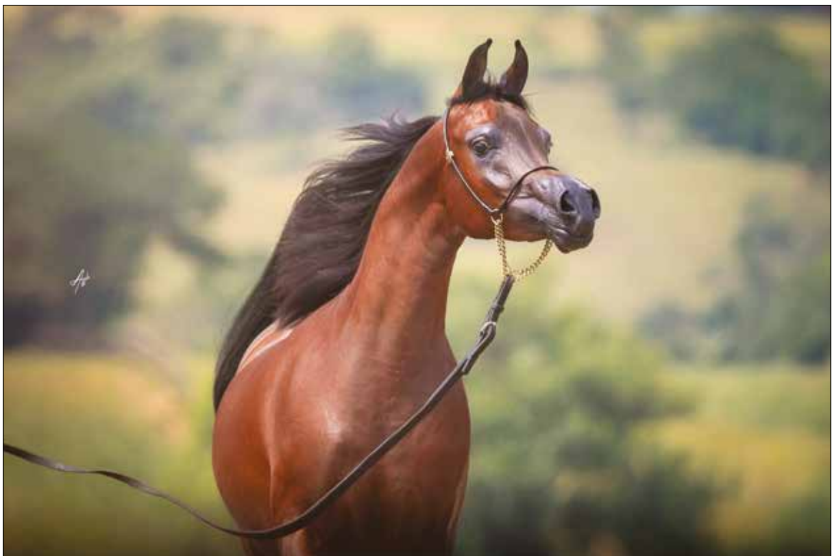
Inyeska Di Calvin JM - (Calvin Del Tino JM x Zruskia JM by RFI Maktub)