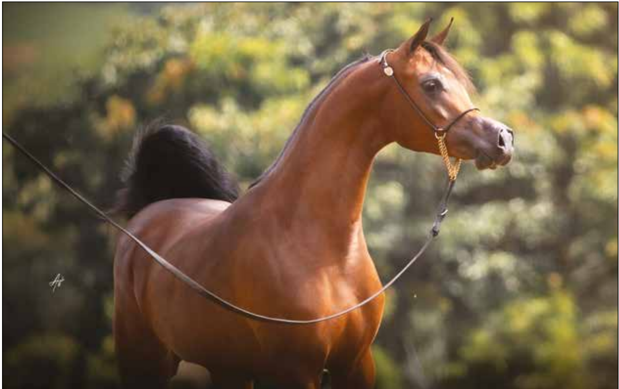
Innazia Farouk JM - (EKS Farouk x Marrakech Arabco by 'El Tino)