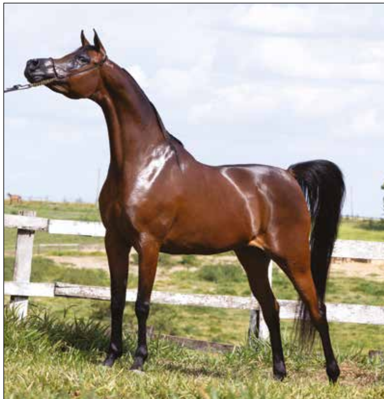
Cancione Del Tino JM ('El Tino x Xaklinna D'Pscore JM) - Born in 2017